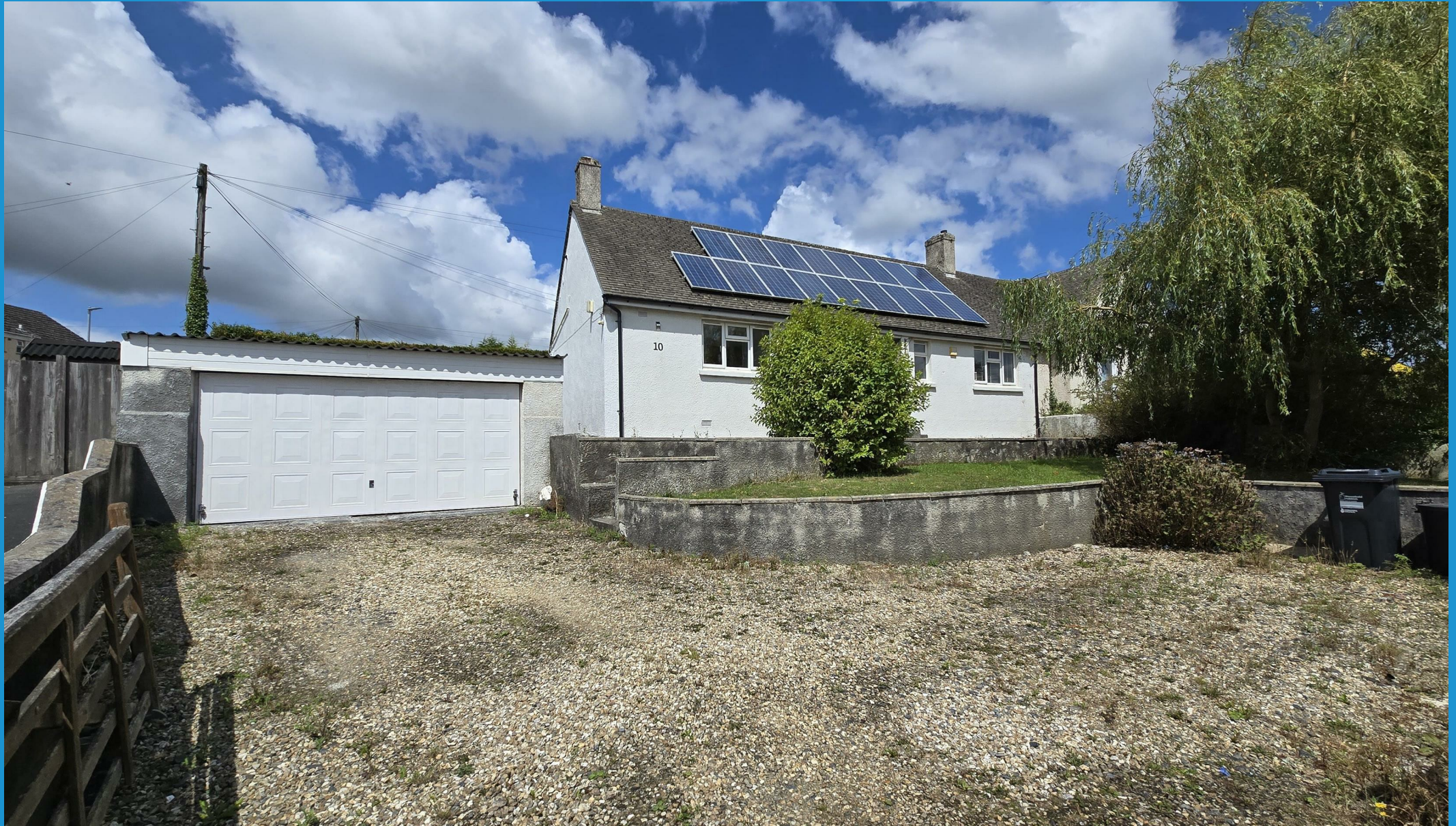
Hurdon Road Launceston | Cornwall